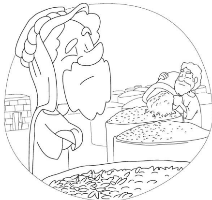
The Parable of the Rich Fool